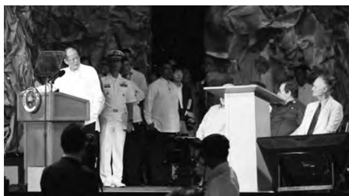
President Benigno Aquino III during the Official Inauguration Ceremonies of the Puerto Princesa Underground River